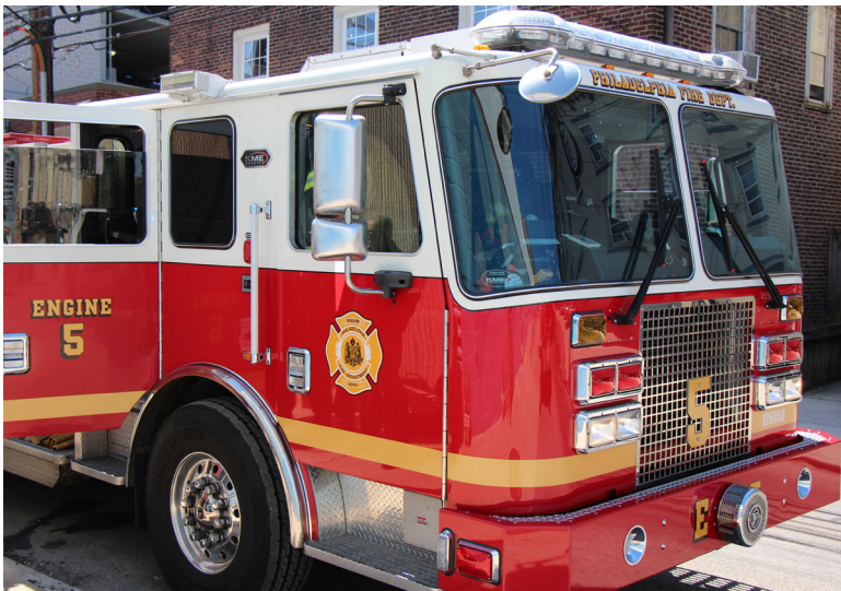
Philadelphia Fire Department, Engine 5

In the few areas where there is a functional fireplace, students must obtain approval for use. Before starting a fire, remove all combustible materials from the area and be sure the flue is open. Keep a screen in front of the fireplace while the fire is burning. Do not use liquid fuel starter and when using paper, limit the amount to avoid quick acceleration that could cause a flare up.